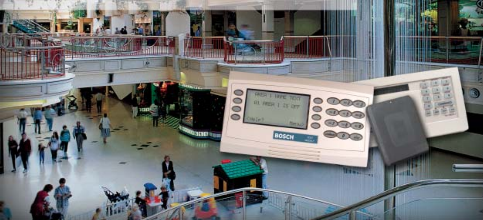
Commercial application and product information