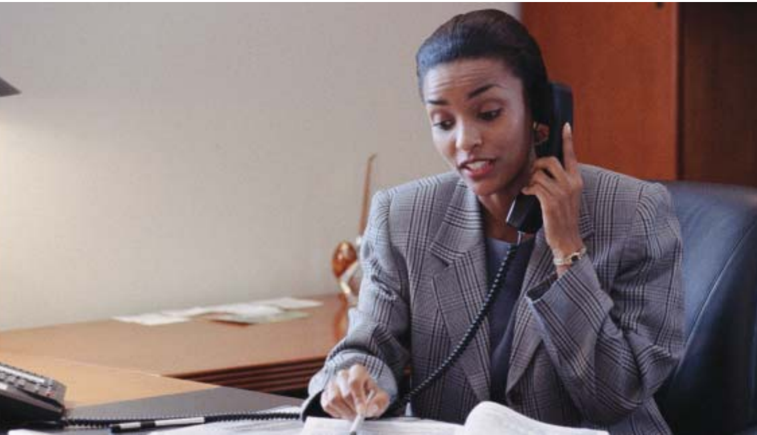
Authorized users can arm individual areas for independent control at any hour with the flexible G Series security controls